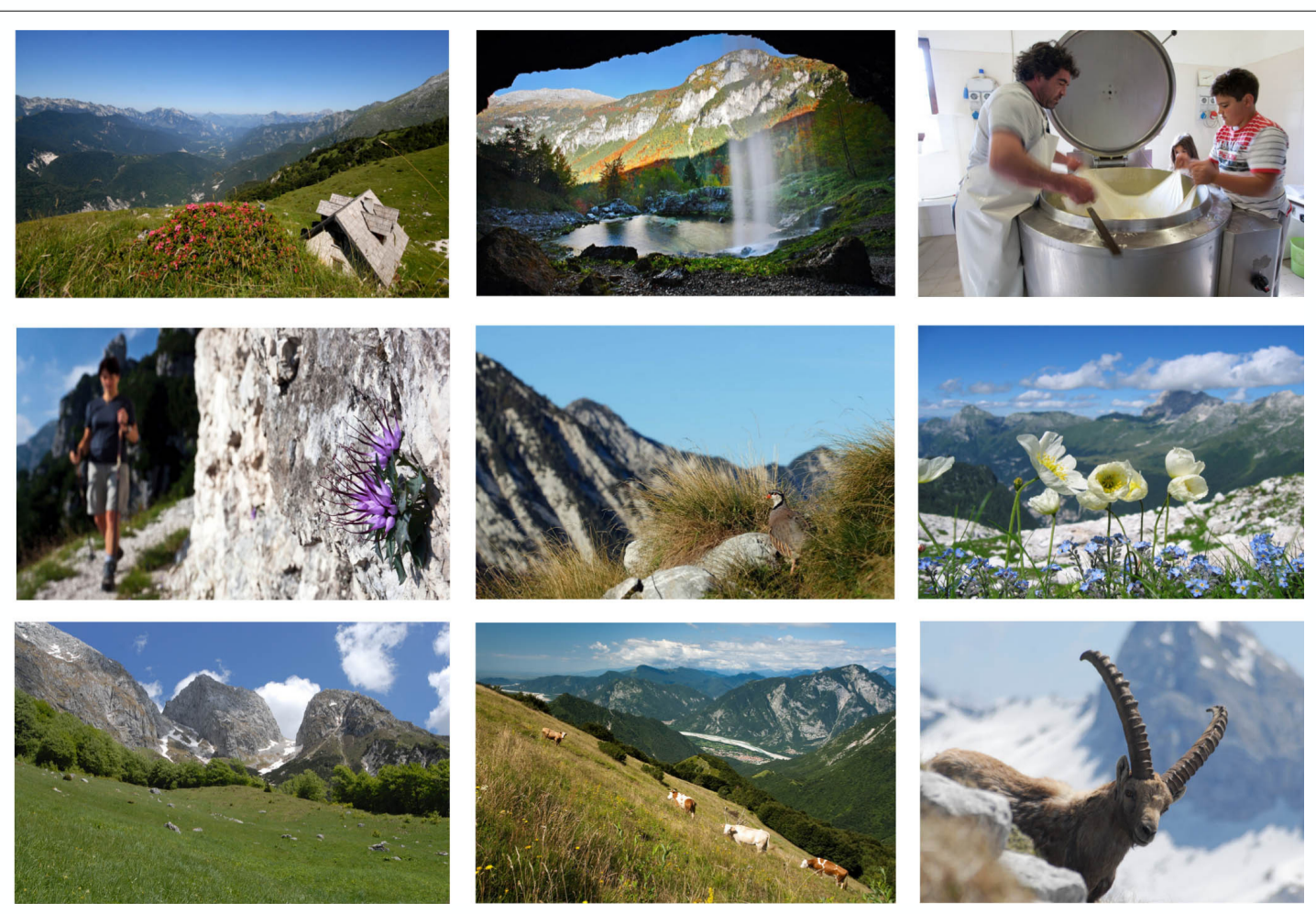
TAV.2a - Carta del perimetro